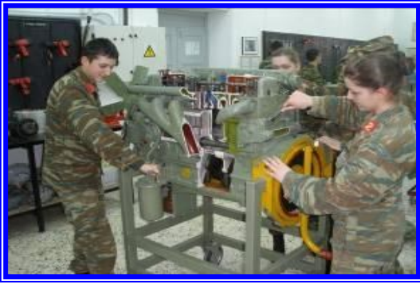
Picture 20 Helicopter Engines Laboratory