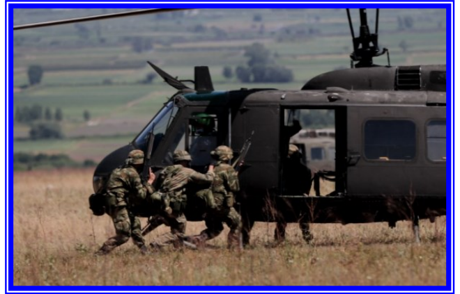
Picture 9, 10 Military training