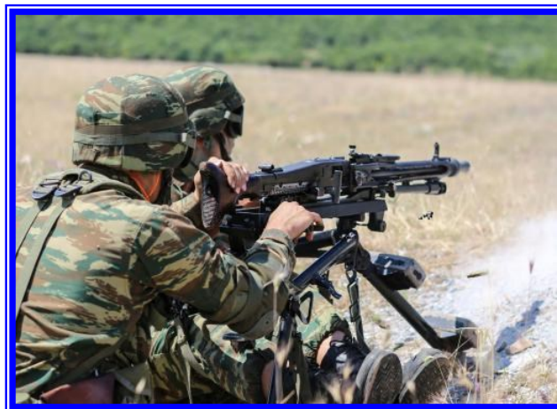
Picture 11 Firing the MG3 machine-gun