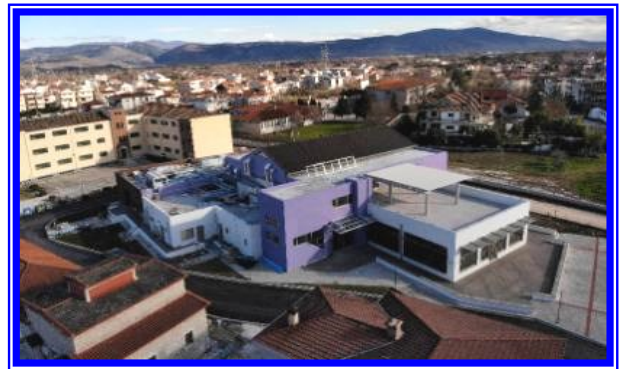
Picture 24,25 Barracks of the Academy

b. The Academy has a Health-Support Department integrated to ensure the physical and mental health of students.