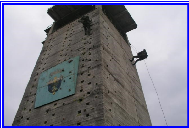
Picture 15 Training at the Climbing Tower