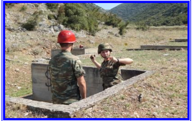
Picture 13 Hand grenade Training