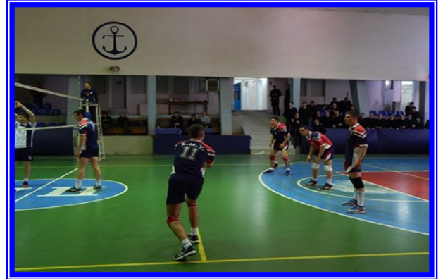
Picture 6 Volleyball team