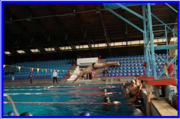
Picture 5 Swimming team