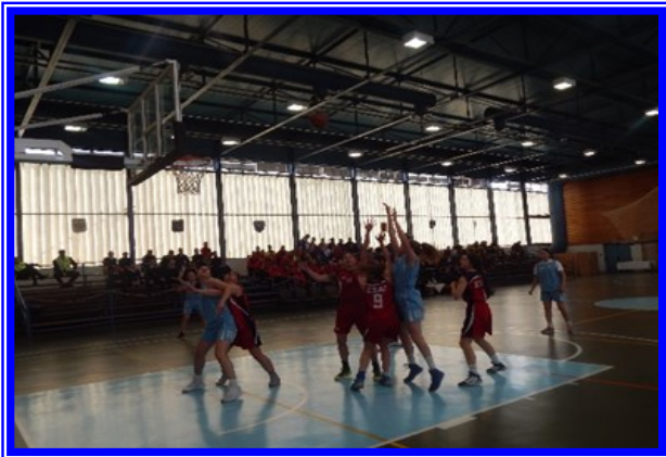
Picture 7 Basketball team