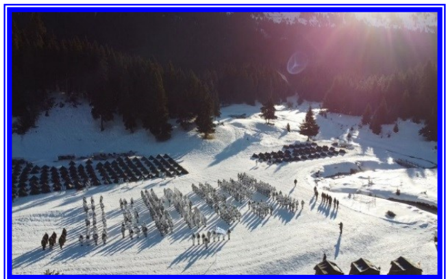
Picture 16 Winter Training