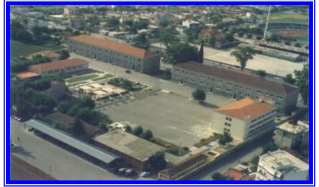
Picture 22,23 Outside view of the Academy