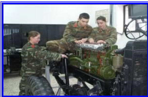
Picture 18 Internal Combustion Engine Laboratory

n. The Technical Education aims at acquiring specialized knowledge, experiences and the necessary skills and abilities so as future NCOs they will have the necessary capabilities to maintain and fix all the modern military equipment of the Hellenic Army. It takes place in designated intramural laboratories and also in nearby military factories.