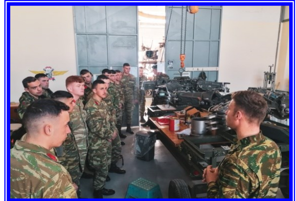
Picture 21 Mechanical Engineering Laboratory