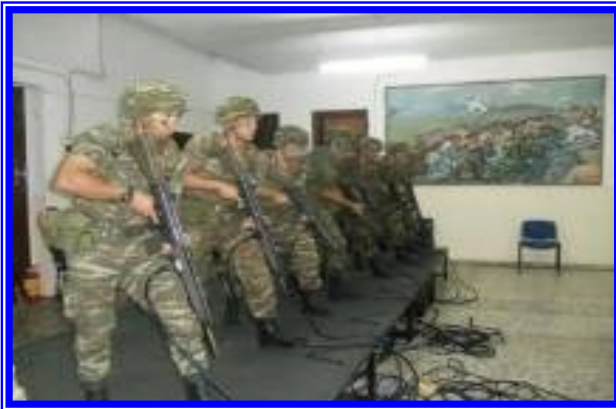
Picture 14 Small Arms Weapons Simulator