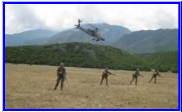
Picture 17 Military training

n. The Technical Education aims at acquiring specialized knowledge, experiences and the necessary skills and abilities so as future NCOs they will have the necessary capabilities to maintain and fix all the modern military equipment of the Hellenic Army. It takes place in designated intramural laboratories and also in nearby military factories.