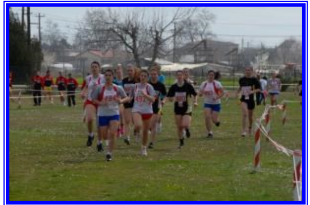
Picture 8 Physical training

i. In the context of Competitive Athletics, the Academy during the Annual Military Academies Athletic Competition competes with the rest of the Hellenic Joint Forces Military Academies athletic teams in various sports. Furthermore, they take part in athletic competitions organized by other foreign and domestic institutions within the context of extroversion of the Hellenic Armed Forces.