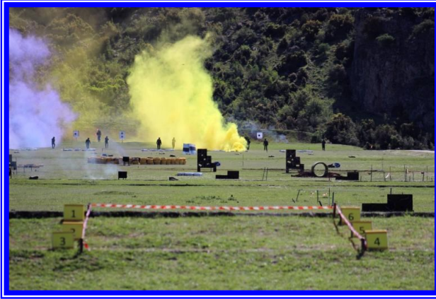
Picture 12 Weapons Training